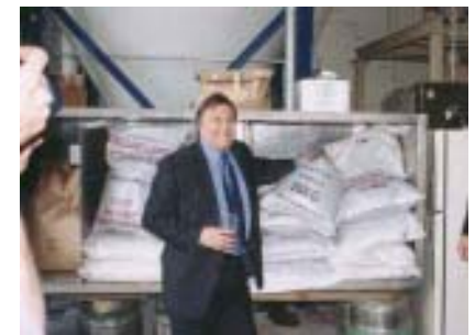
John Prescott visits the Lakefront Brewery Co. in Milwaukee.